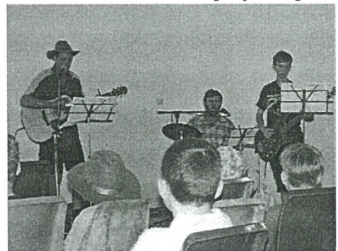
Performing Christmas Carols for kids at Gregory Downs. Many families travel great distances to give their children the opportunities city kids take for granted.