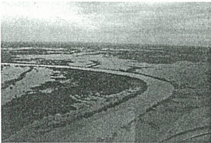
Floods cause major disruptions to outback life and food drops are an essential part of the Padre's role

Despite the improvement in the road network, the vagaries of weather in the Northwest still necessitates that quite often communities, stations and people are isolated for months on end, where the only transport accessible is expensive air transport. Isolated families often call upon the padre to deliver much needed supplies or to fly in or fly out staff and family members.