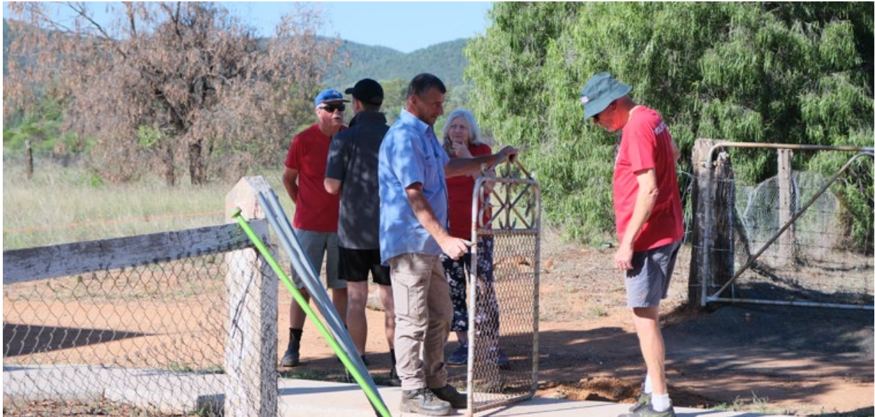
Outback Links volunteers invited to support a local couple on the land

Frontier Services is calling on volunteers to join our next Outback Links trip to Wallumbilla, Queensland , from Sunday 3 to Friday 8 August 2025 - a unique opportunity to make a real difference in the life of a rural family.